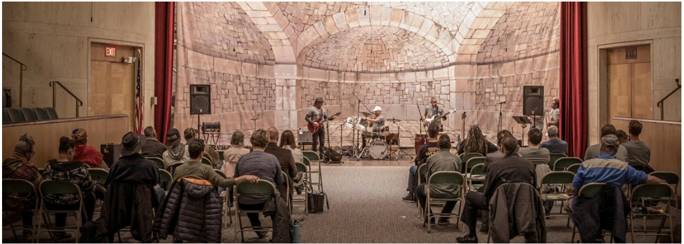
The Amphitheater of The Masonic Center was the location of our meeting.